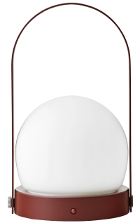
Burned Red 4864349