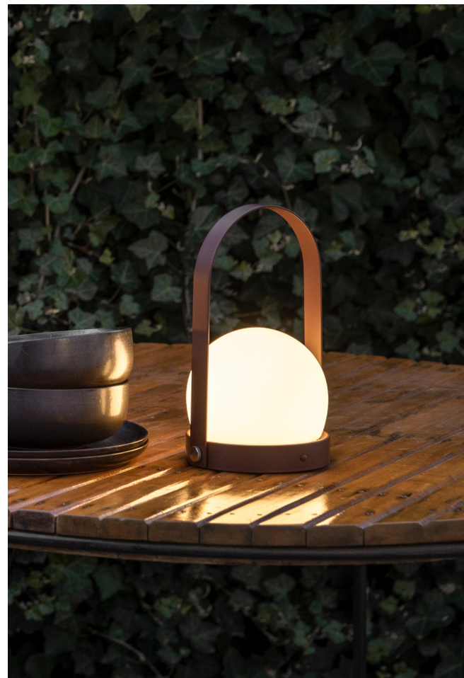
Carrie Table Lamp, Portable, Burned Red, by Norm Architects New Norm Dinnerware, Dark Glazed, by Norm Architects

A minimalist innovation for freedom and flexibility, Carrie Table Lamp, Portable with a metal or plastic base and glass shade is unique for its multiple uses and mutability. Useful almost anywhere – even on the go – the cordless design comes with a concealed magnetic connector at its base for easy charging. The plastic base version is approved for outdoor use.